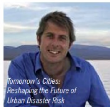
Tomorrow's Cities: Reshaping the Future of Urban Disaster Risk